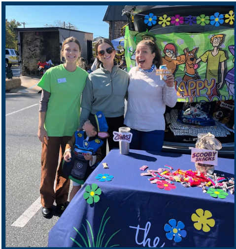
Selbyville Trunk or Treat | Oct. 19