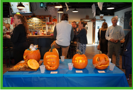
October 2024 Business After Hours at Bethany Brewing | Oct. 16