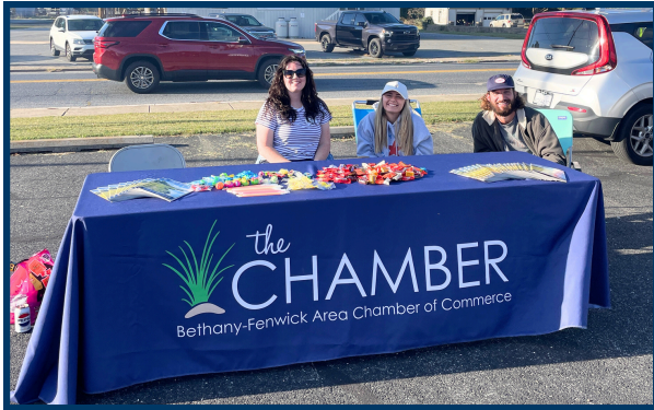
Dagsboro National Night Out | Oct. 8