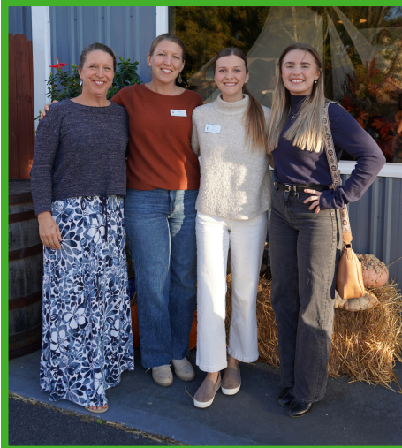
Rlyne Boutique Ribbon Cutting | Oct. 30