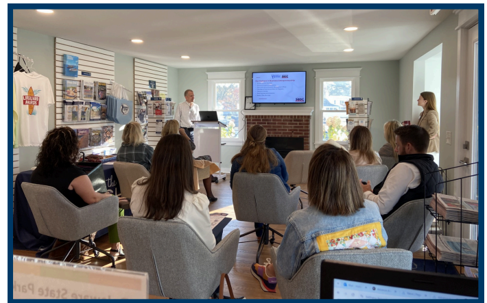
Connect for Coffee at Clove & Cedar Coffeabar | Oct. 31