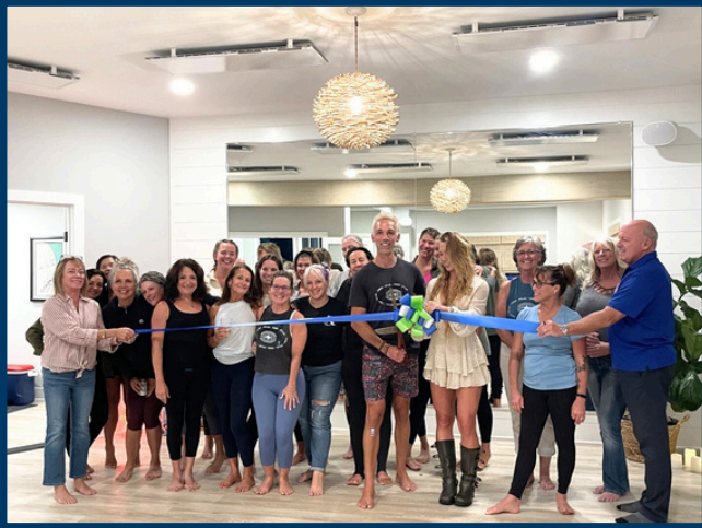
Atlas Yoga & Healing Arts Grand Opening Ribbon Cutting, Sep. 17