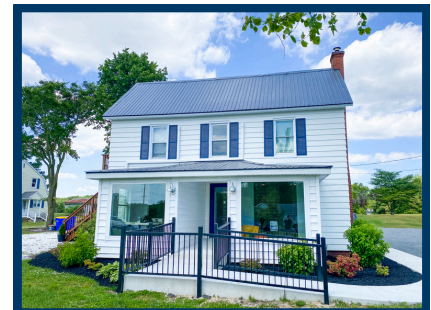
Dagsboro 33370 Main St., Dagsboro