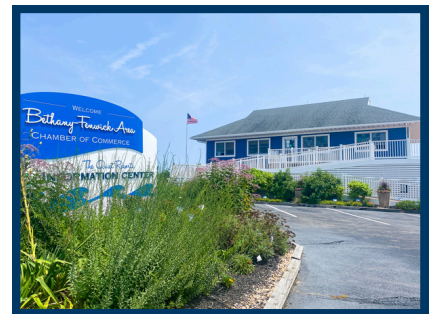
Fenwick Island 36913 Coastal Hwy., Fenwick Island