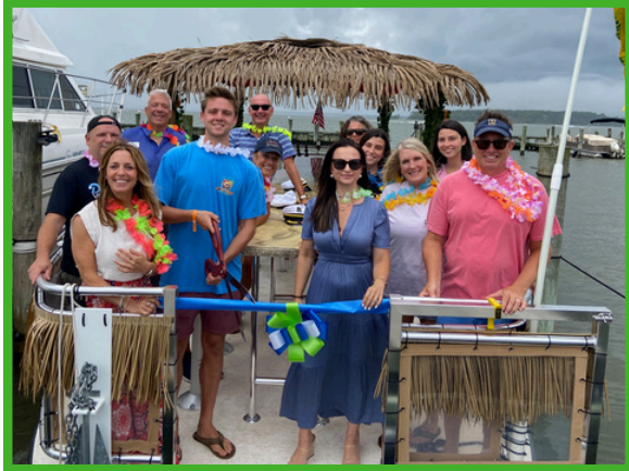
Good Vibes Tiki Cruises Ribbon Cutting, Aug. 7