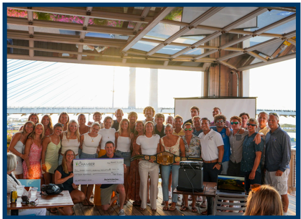
BFACC Donation to Sussex County Lifesaving Association, Aug. 13