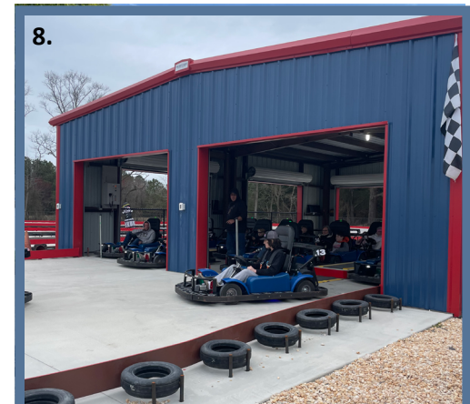
1. Rejuvenation Skin Wellness & Aesthetics Ribbon Cutting Ceremony 2 - 4. DE Botanic Garden's Season Opening 5. March Business After Hours at Delmarva Design Center 6. One Wellness Spa & Boutique Ribbon Cutting Ceremony 7 - 8. Captain's Quarters Ribbon Cutting for Go Karts