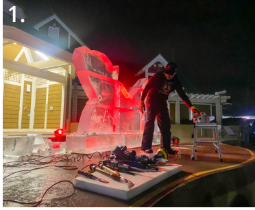
PHOTO BOARD - FIRE & ICE FESTIVAL