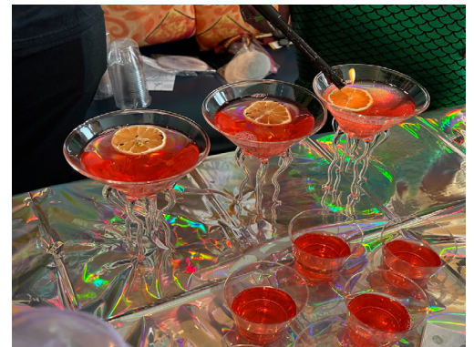
1. Sarge Athletics Ribbon Cutting